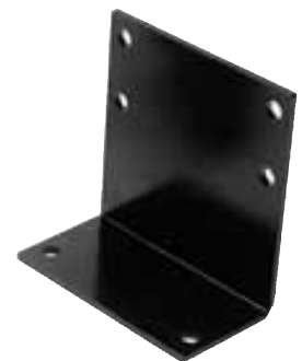
6999 Wall Mounting Bracket