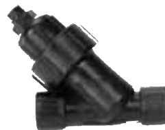
6998 Inline Suction Screen. To be used on inlet of pump when transferring USED product.