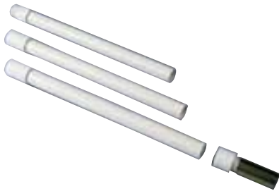
6996 Suction Pipe/Check Valve Assembly. Required with On-Demand Pumps.