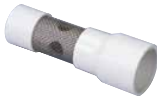
6997 Inlet Suction Screen. To be used when pumping USED product.