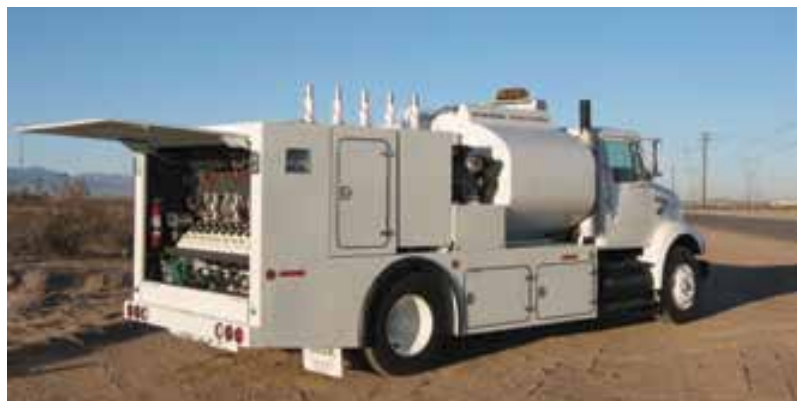
Lube trucks of all shapes, sizes and capabilities.