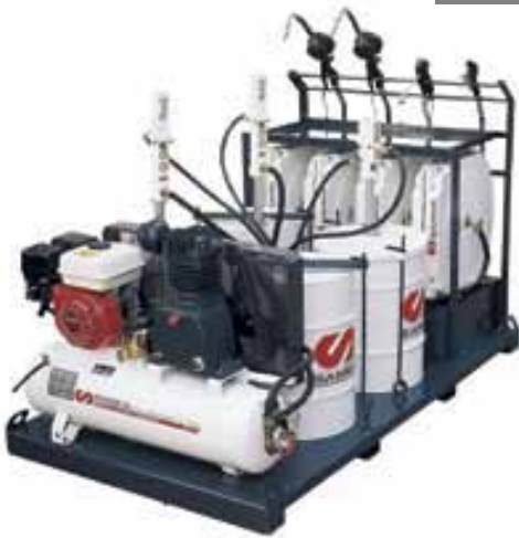
A wide variety of lube skids, designs and equipment packages are available.