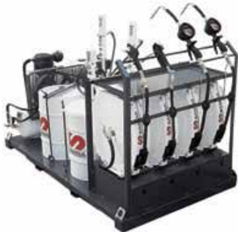
Depending on your application, lube trailers can be a flexible solution.