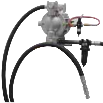
Model 379 701 – Used Fluid Evacuation System

Wall Mounted 1" UL listed diaphragm pump for evacuating gravity drains. Complete kit, includes: